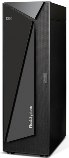
IBM FlashSystem A9000R

IBM FlashSystem A9000 and IBM FlashSystem A9000R are both built using IBM Spectrum Accelerate™ software-defined storage technology. IBM Spectrum Accelerate offers a mature set of storage services that have been developed with cloud and virtualized environments in mind. Thanks to the combination of this software foundation with patented IBM hardware architecture, these solutions provide cloud-critical functionality, including: