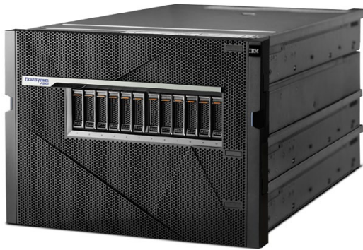
IBM FlashSystem A9000

IBM FlashSystem A9000 and IBM FlashSystem A9000R all-flash storage systems are specifically designed to help build CSP-like capabilities in virtually any business. IBM FlashSystem A9000 is engineered for CSPs as well as enterprises that must extend the capabilities of their cloud infrastructures with high-performance, cost-effective flash storage in an compact modular platform. IBM FlashSystem A9000R is designed for the global enterprise with data-at-scale challenges. The rack-based system enables large organizations to implement cloud-based solutions with quality of service and multi-tenancy features that can easily scale into the petabyte range.